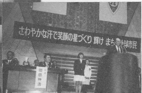
↑ At Kyoto General Assembly "You are welcome!"