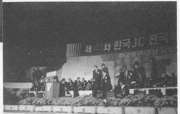
Congress News spreading in the Korea JC National Convention. →