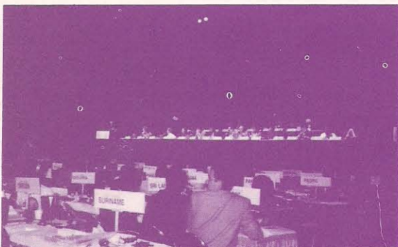
JCI Officers and Chief Delegates discussing important issues at the General Assembly

Over 20 training programmes will be held for the benefit of the JC members. Outstanding international speakers and prominent figures will be invited to give speeches on a wide range of diversified topics.