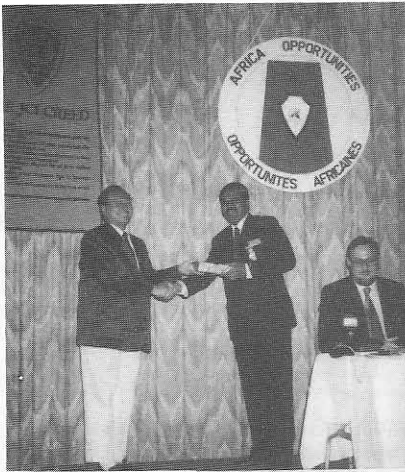
Hosting VIP luncheon at Area B Conference ↓

CONGRESS THEME: MUTUAL UNDERSTANDING – KEY TO GLOBAL UNITY