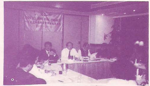
The Congress Organising Committee (COC) members contributing their ideas during the COC Meeting.