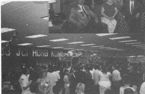
The flying dragon – a symbol of our great job! ←