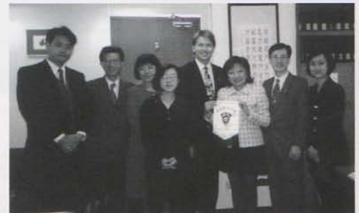
Visit to the Home Affairs Branch