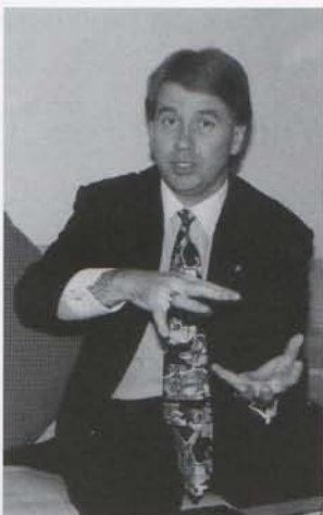
"I challenge you to be the most outstanding NOM of 1996"

The reason is that I think LOMs should balance their programs between the 5 areas of opportunities - as not too many Chapter Presidents have a clear understanding of the same and if they don't