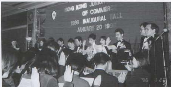
Followed by the sworn-in of Chapter Presidents