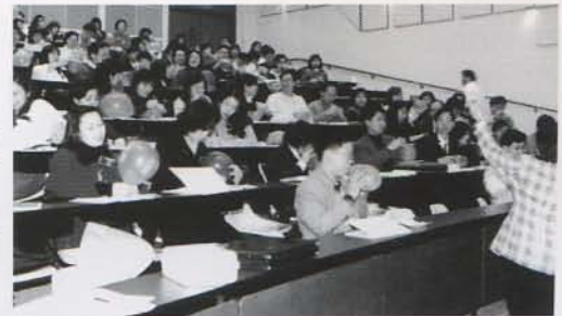
Colourful balloons and marching tunes brightened up the spirit of our officers.