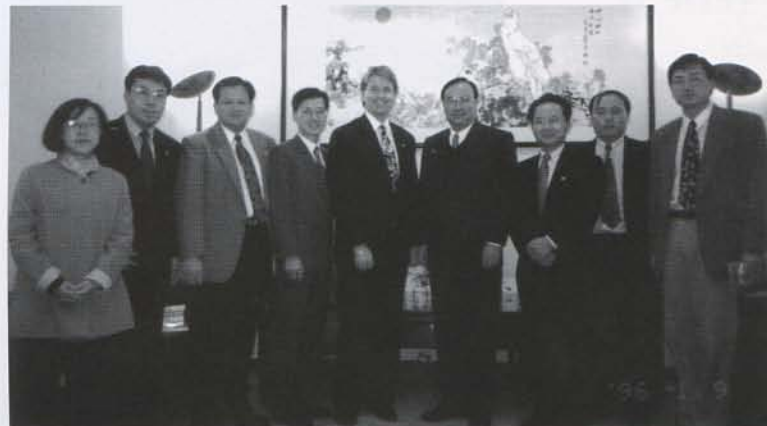
Visit to the Xin Hua News Agency