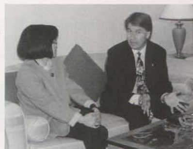
"Balanced opportunities is important to raising international stature gradually"

No. 1: Commitment to operate quality learning programmes for members. The level of commitment has been