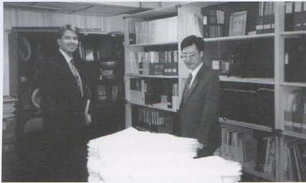
World President and National President spot checked our mailing service